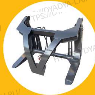
Grab a wooden fork