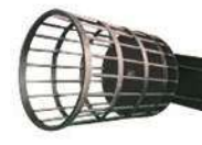
Stone screening machine