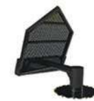
High speed tree saw