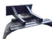
Simple manure pushing machine