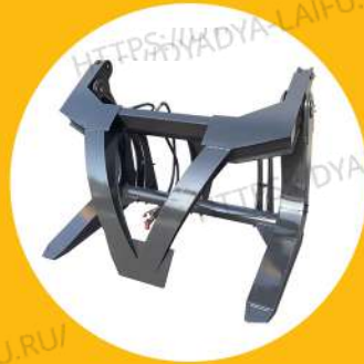
Grab a wooden fork