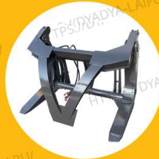
Grab a wooden fork